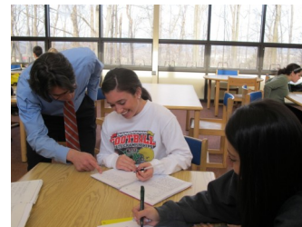
High School students can get help with their writing at the Writing Center. Sign up in the HS library.

end. Ten wrestling teams will compete in the event, which runs Friday and Saturday.