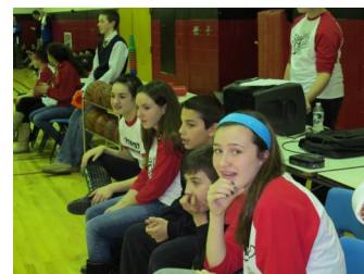
Members of the MS Student Council enjoy the MS pep rally last week. Students shot baskets, played musical chairs and showed their spirit.