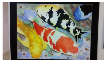
One of the creations by our students featured in the 7th Annual Teen Arts Jam.

Seventeen West Essex High School students will have their artwork featured in the 7th Annual Teen Arts Jam at