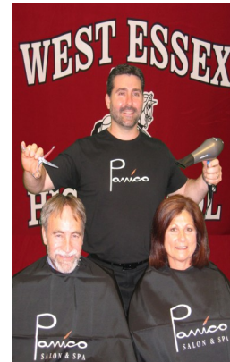
Even School Administrators plan to grow their hair long for the event.