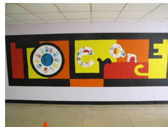
The West Essex Middle School Art Club painted a mural with the "Tolerance" theme.

Juniors can learn to Outsmart the SAT at Catalyst's SAT Boot Camp at West Essex High School Saturday March 3 and Sunday March 4 from 9 a.m. to 1 p.m. Many students do not have time for weekly prep classes and it takes a long time to get your mock scores. In just one week, students will learn every strategy they need for the test. The course also costs $100 for the entire weekend , which includes course and prep materials. To register, call (800) 235-0056 after 11 a.m.